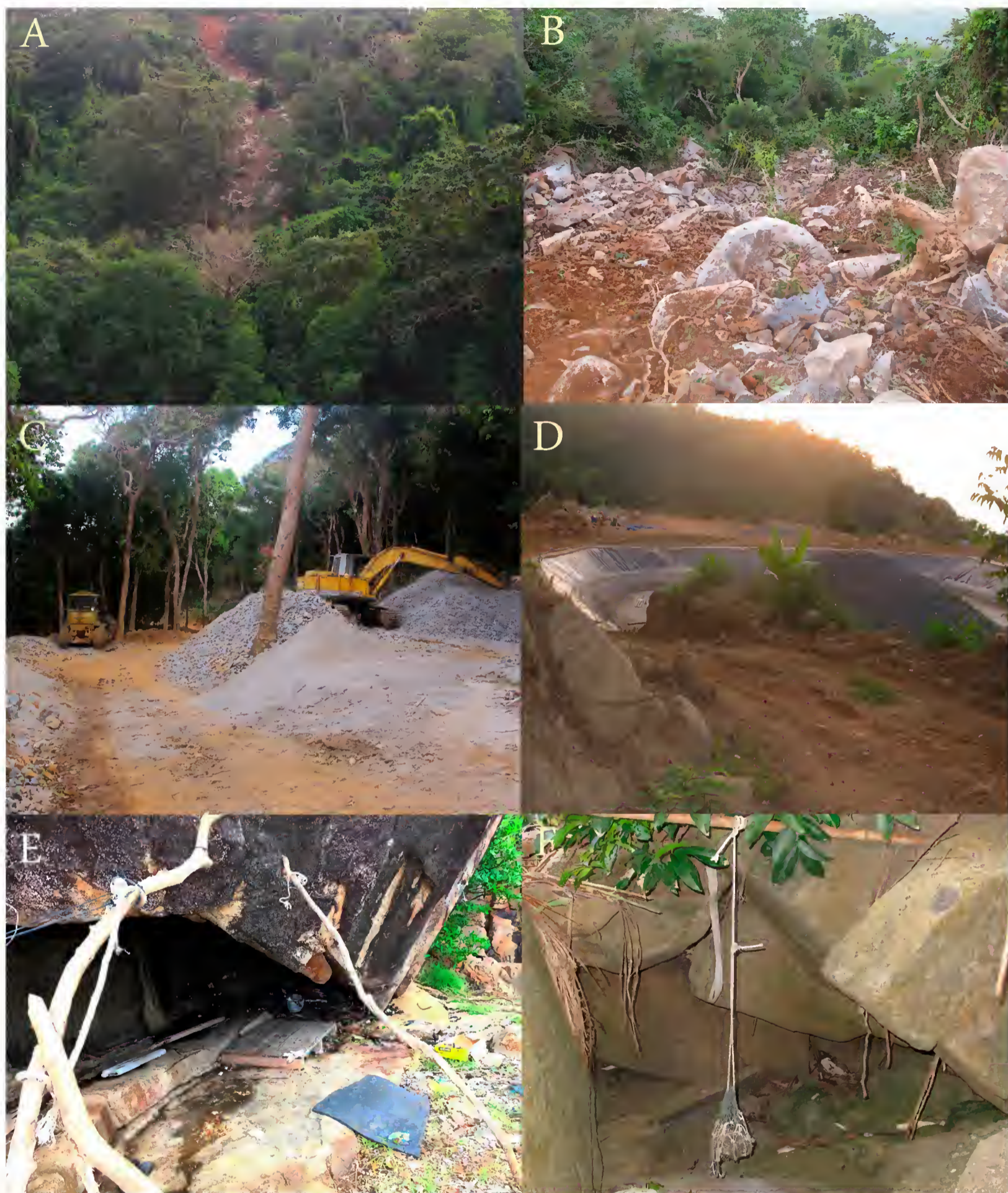
Fig. 4. Potential threats to Cnemaspis psychedelica . A. Erosion caused by opening of new ways; B. Forest opening and blasting of granite karst formations; C. Building of new roads; D. Building of artificial ponds to store freshwater; E. Camp of a fisherman living on the island; F. Trap for Monitor lizards.

to the island is generally prohibited (e.g., Altherr 2014; Auliya et al. 2016; Nguyen et al. 2015).